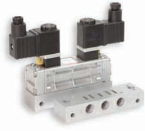
ESY - 52 - 1/4p+PBA